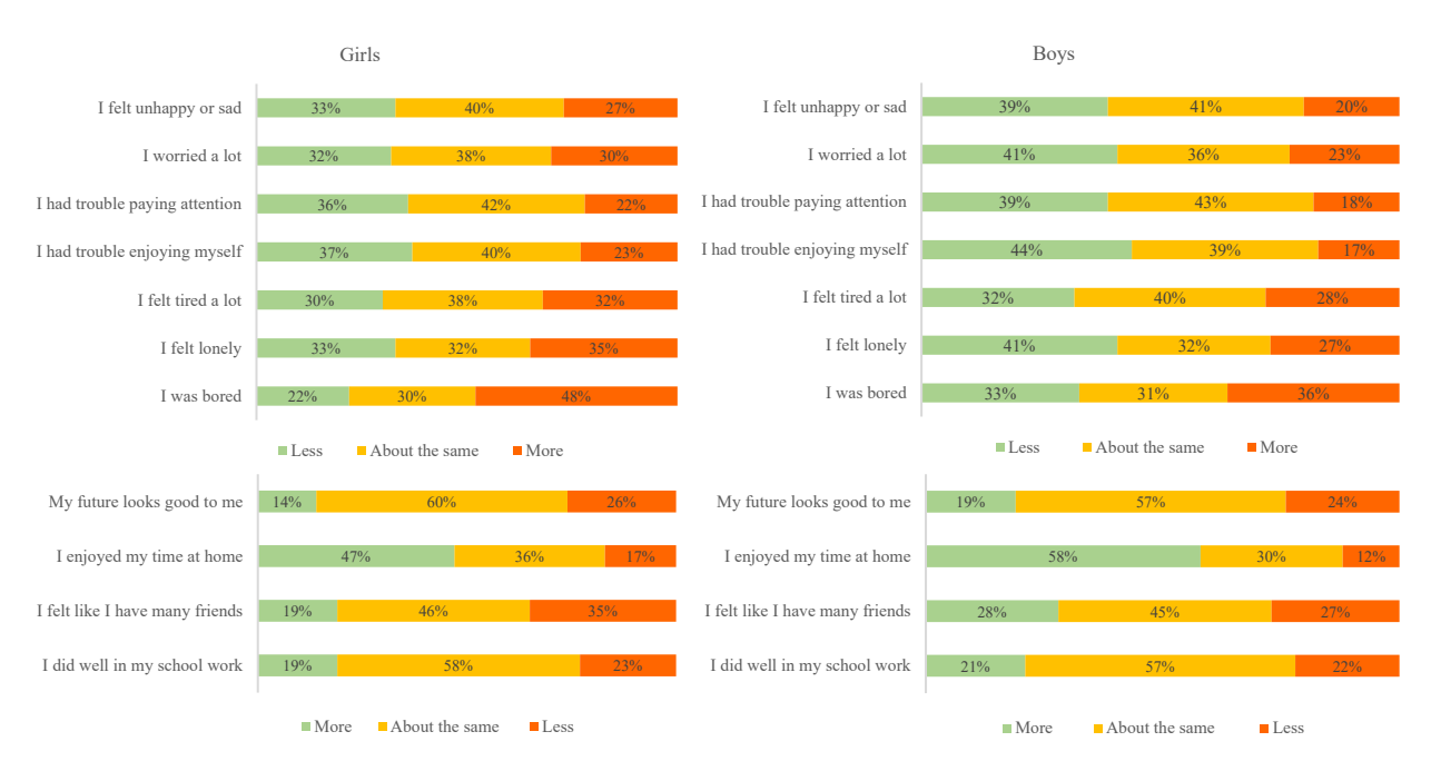
Fig. 2. Changes in mental health and wellbeing during vs before the lockdown.

The present study reported on changes in the lifestyle behaviours and mental health and wellbeing, as perceived by elementary school—aged children living in socioeconomically disadvantaged communities, during the Spring 2020 COVID-19 lockdown.