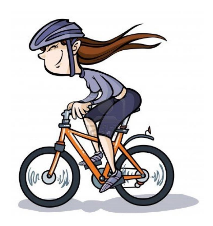
Because they are two-tired!

Dehydration – not having enough water – can cause our bodies to become too tired or fatigued. Water keeps you hydrated and gives you a boost in energy.