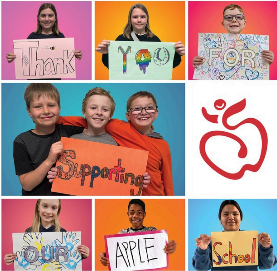
Students from Conklin School (Conklin, AB), Onoway School (Onoway, AB), Vincent Massey School (Medicine Hat, AB) and Douglas Harkness School (Calgary, AB), sent their appreciation for our donors in some very colourful and creative ways!